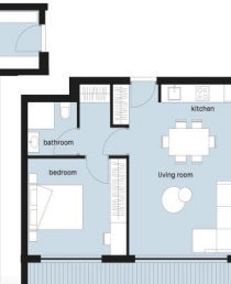
Flats 104/204 Kitchen/Living 33.4m 2 Bedroom 12.025m 2 Bathroom/Laundry 6.1m 2 Covered veranda 17m 2