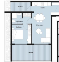
Flats 104/204 Kitchen/Living 34.86m 2 Bedroom 11.34m 2 Bathroom/Laundry 6.3m 2 Covered veranda 19.44m 2