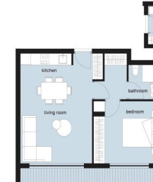
Flats 103/203 Kitchen/Living 33.4m 2 Bedroom 12.025m 2 Bathroom/Laundry 6.15m 2 Covered veranda 17m 2