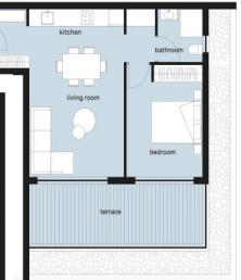
Flats 102/202 Kitchen/Living 33.19m 2 Bedroom 12.81m 2 Bathroom/Laundry 5.6m 2 Covered veranda 15.48m 2