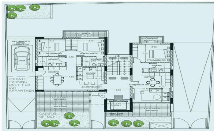
Κάτοψη Ισογείου 001 και 002