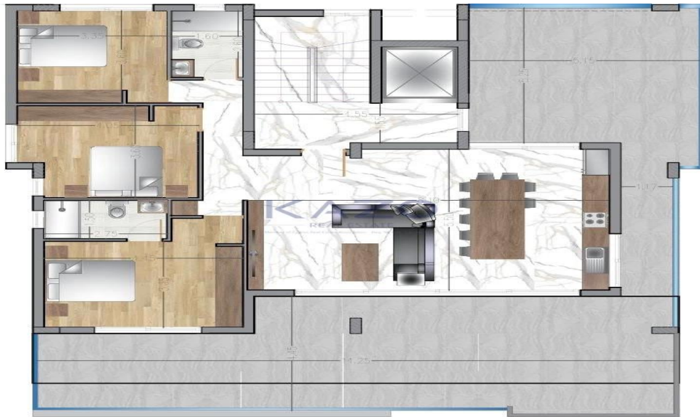
ΚΑΤΩΨΗ Γ ΟΡΟΦΟΥ