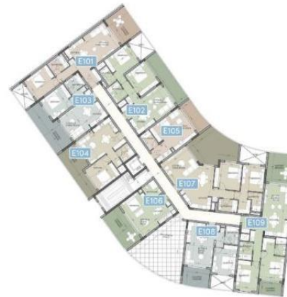
1st floor Block E