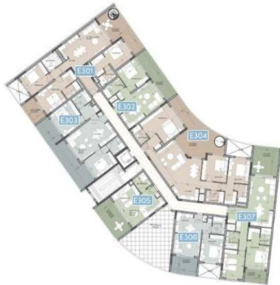
3rd floor Block E