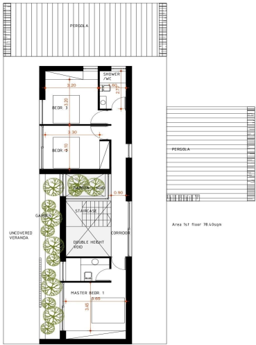
TYPE 2 | TWO STOREY ΚΑΤΩΗ ΟΡΟΦΗ