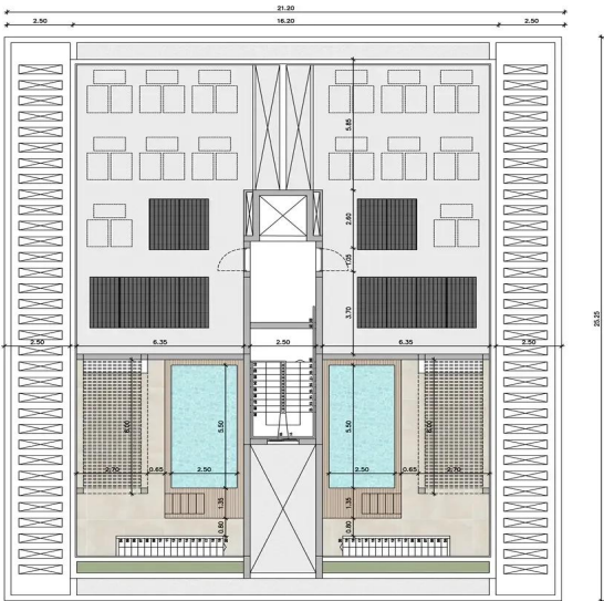
BANGLAY ROOF TOP