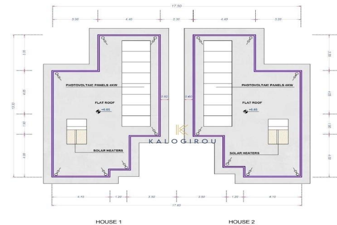
ROOF PLAN SCALE 1-100