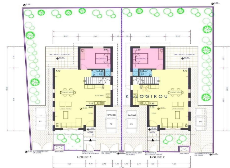
GROUND FLOOR PLAN SCALE 1-100