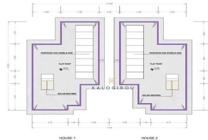
ROOF PLAN SCALE 1-100