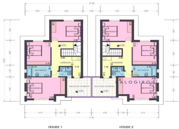
FIRST FLOOR PLAN SCALE 1-100