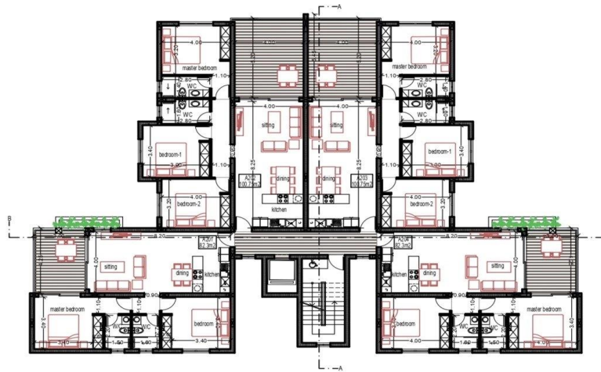
Κατοψη 2ου Οροφου