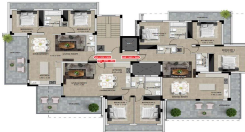
FLOOR PLANS FIRST, SECOND AND THIRD FLOOR