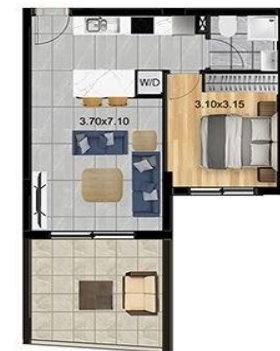
Internal Area # 50 SQM Covered Veranda # 15 SQM