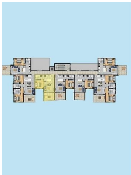
SECOND FLOOR PLAN FLAT 203