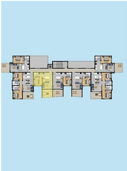
SECOND FLOOR PLAN FLAT 203