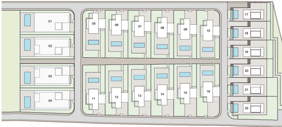
HOUSE TYPE A- HOUSES 01-04 HOUSE TYPE B- HOUSES 05-16 HOUSE TYPE C- HOUSES 17-22