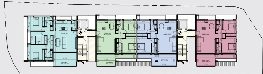
③ 2nd floor 1:200