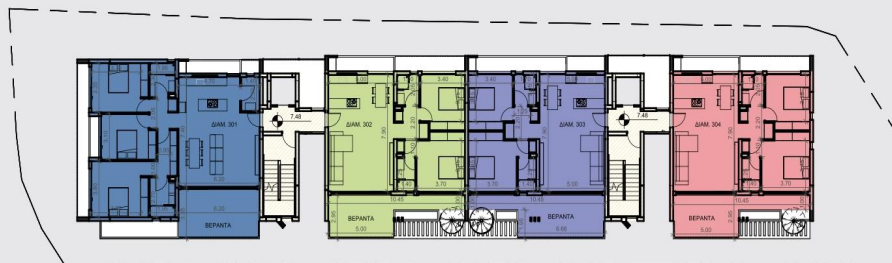
④ 3rd floor 1:200