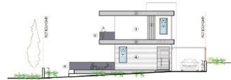
TYPE B | 3 Bedroom | Villa 1 & 9