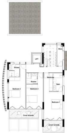
Villa 1 - First Floor Plan