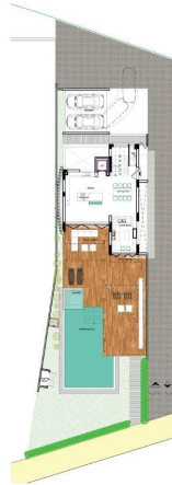
Villa 1 - Ground Floor Plan