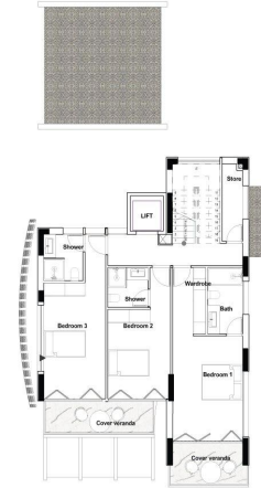
Villa 1 - First Floor Plan