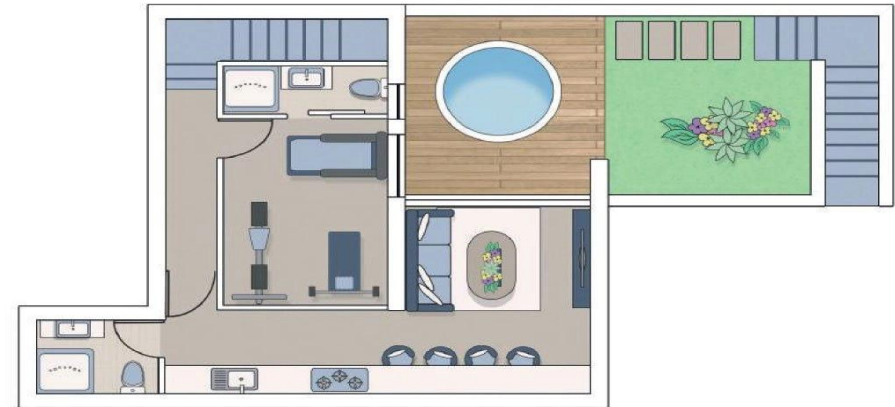
Lower Floor Plan