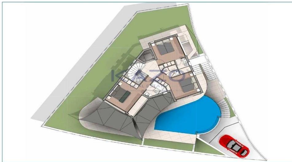
PRELIMINARY FIRST FLOOR