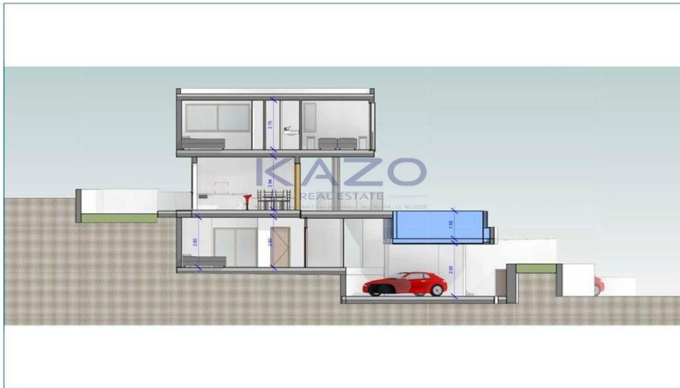
PRELIMINARY SITE PLAN