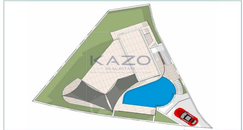
PRELIMINARY SITE PLAN