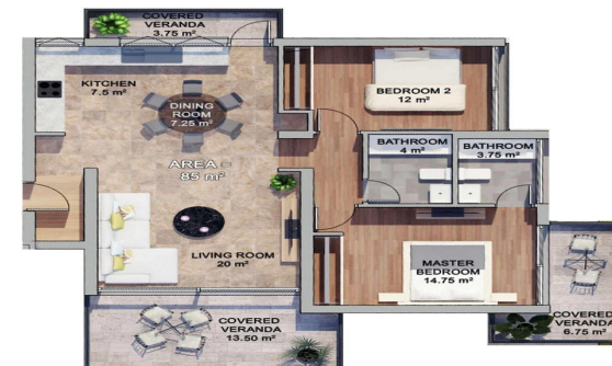
BLOCK C | FLOOR 2 202