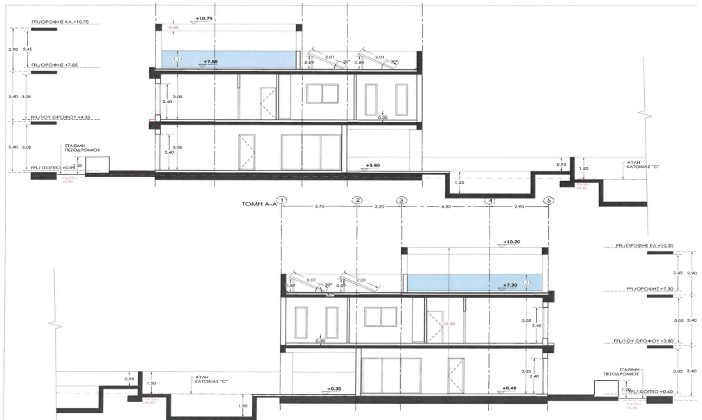
ΤΥΠΟΣ 2 ΚΑΤΟΙΚΙΕΣ Β & Δ