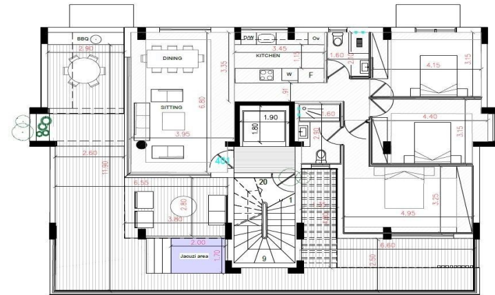
FOURTH FLOOR PLAN