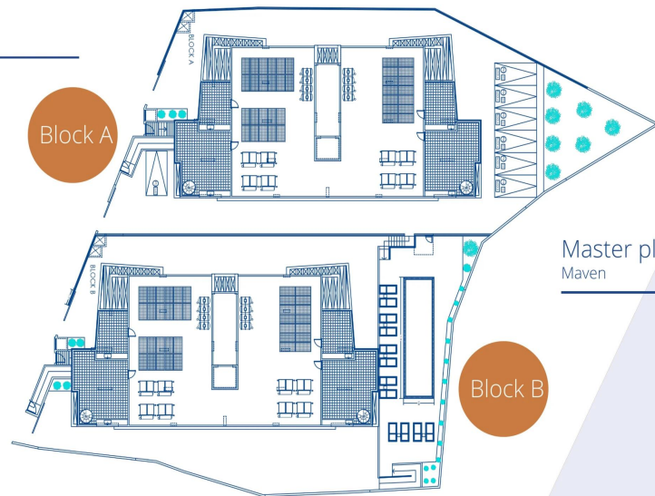
Master plan Maven