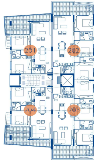
Second floor plan