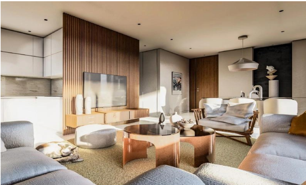
APARTMENTS 101 - 201 - 301