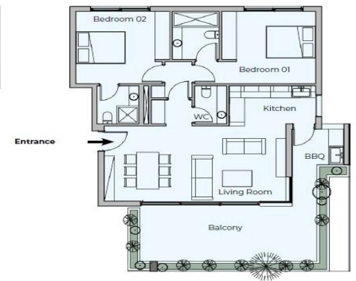
APARTMENTS 102 - 202 - 302

2 Beds 25m 2 Covered Veranda 88.5m 2 Indoor