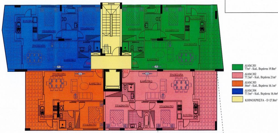
ΚΑΤΟΨΗ 3ου ΟΡΟΦΟΥ