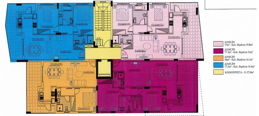
ΚΑΤΟΨΗ 2ου ΟΡΟΦΟΥ