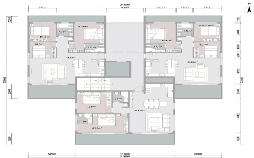
3 Bedroom Plan