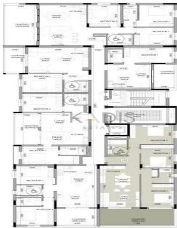
2nd floor plan