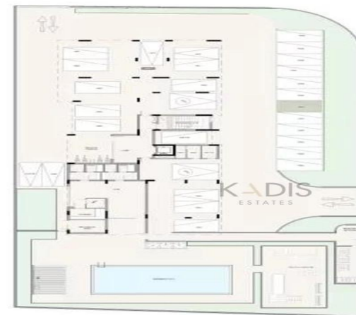
ground floor plan