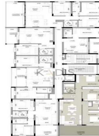
3rd floor plan