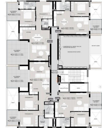
block a floor 3