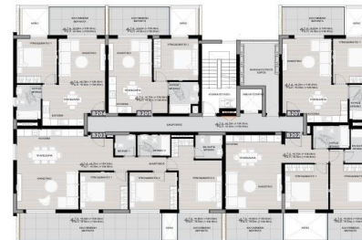
block b floor 2