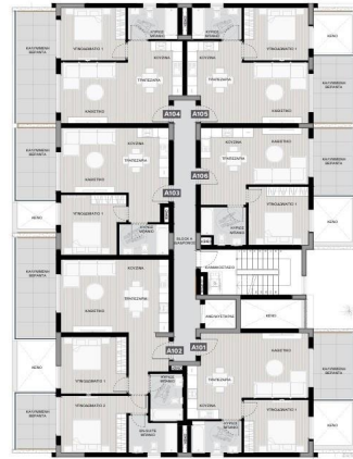
block a floor 1