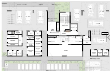
block b ground floor