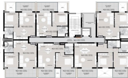
block b floor 1