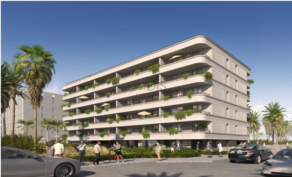
| basement | block A