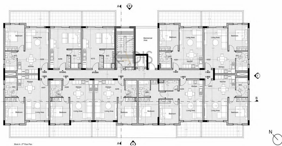
| 2nd floor | block A