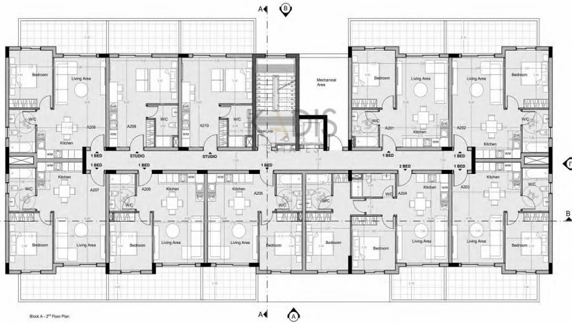
| 2nd floor | block A