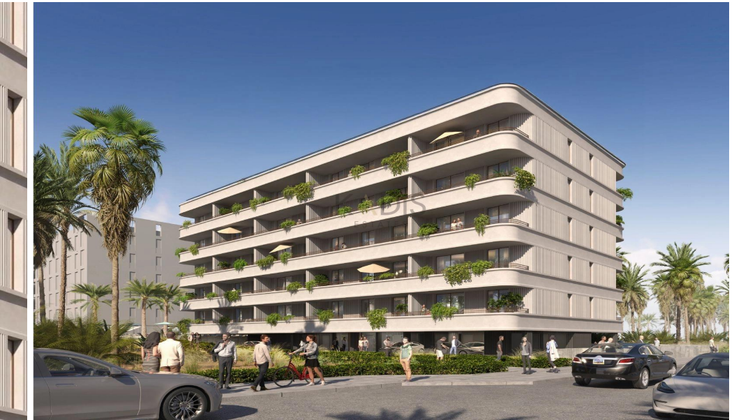
| ground floor | block A