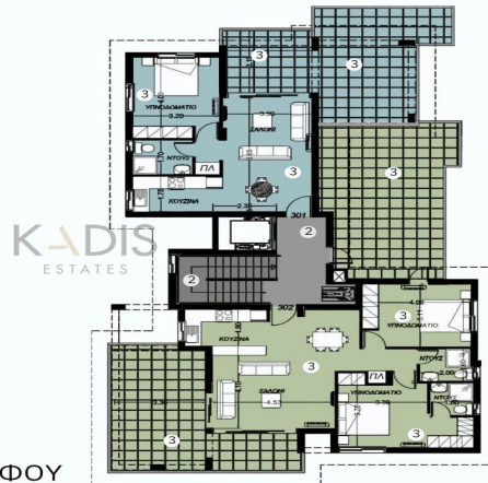
ΚΑΤΟΨΗ ΤΡΙΤΟΥ ΟΡΟΦΟΥ