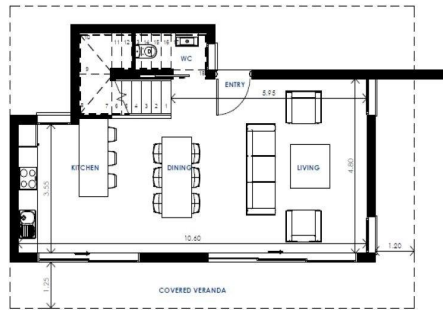
1 GROUND FLOOR 1 : 100