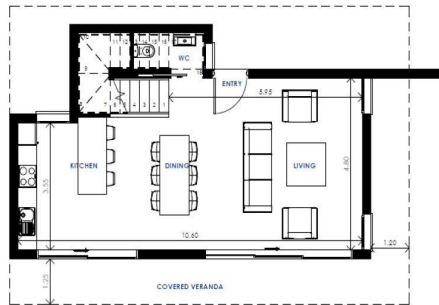
1 GROUND FLOOR 1 : 100