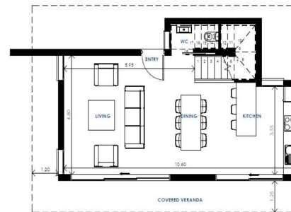
1 GROUND FLOOR 1 : 100