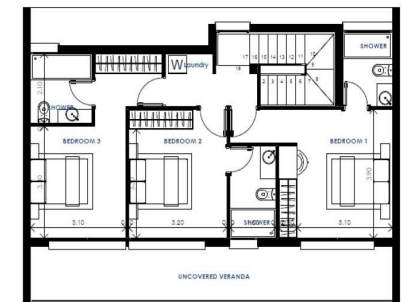
2 FIRST FLOOR 1 : 100