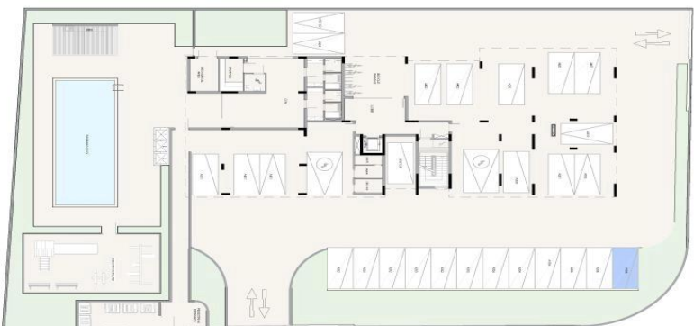
ground floor plan