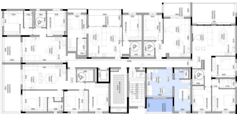
1st floor plan