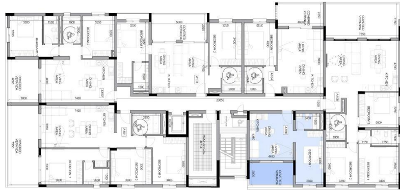
1st floor plan