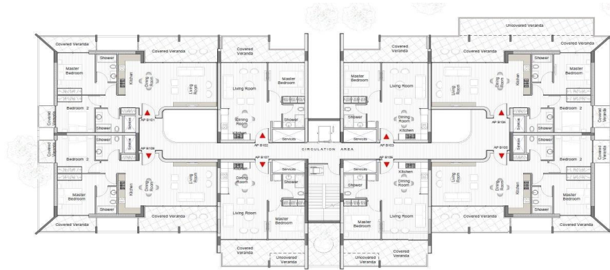
A002-BLOCK B FIRST FLOOR