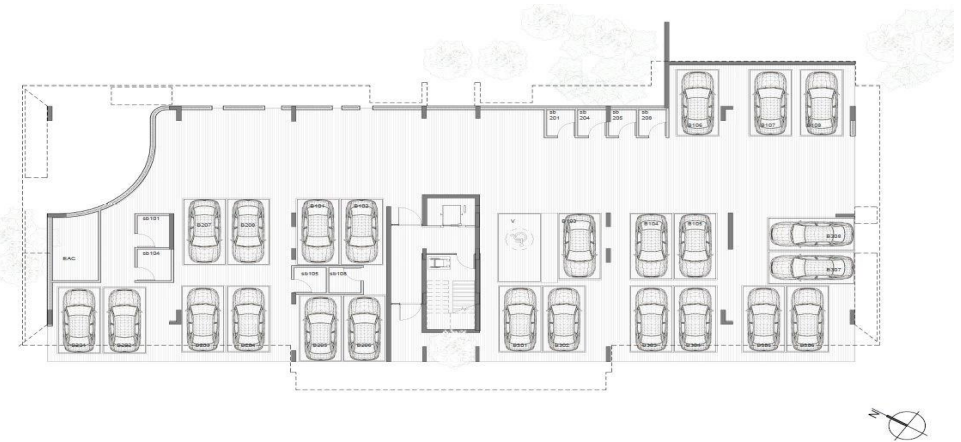
A001-BLOCK B PILOTI FLOOR 1:100