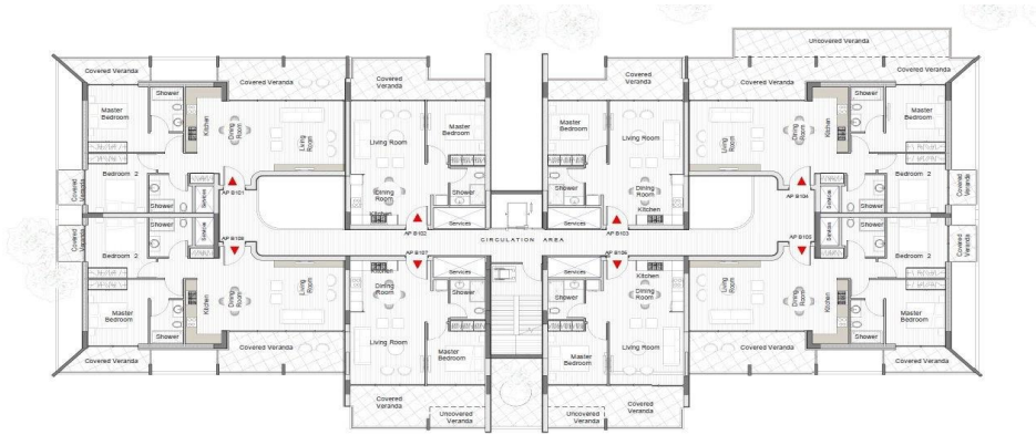
A002-BLOCK B FIRST FLOOR