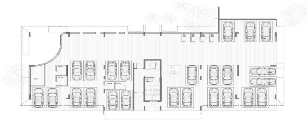
A001-BLOCK B PILOTI FLOOR