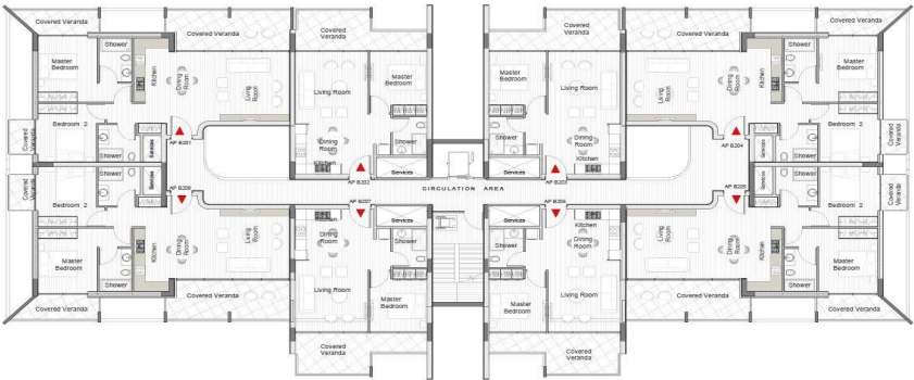
A003-BLOCK B SECOND FLOOR