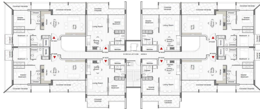
A003-BLOCK B SECOND FLOOR