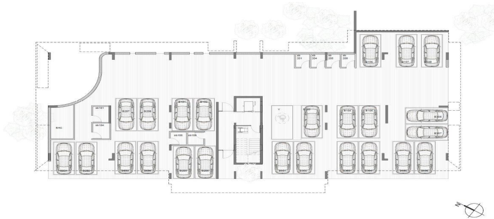
A001-BLOCK B PILOT FLOOR 1/100