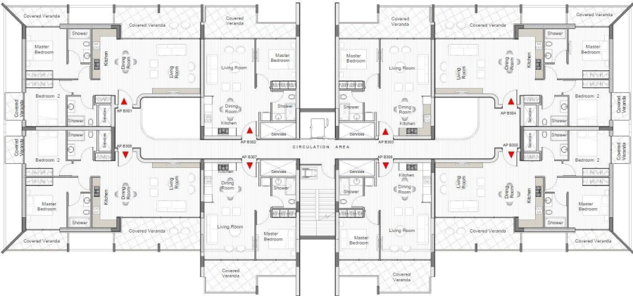
A004-BLOCK B THIRD FLOOR