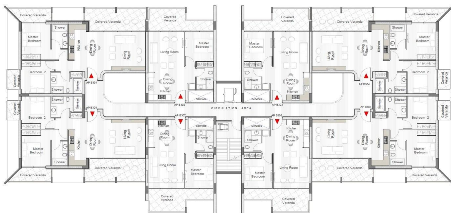
A004-BLOCK B THIRD FLOOR 1:100