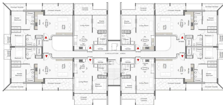
A004-BLOCK B THIRD FLOOR 1:100