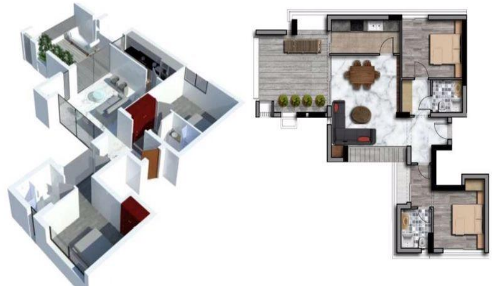
The Ideal - Two Bedrooms flat