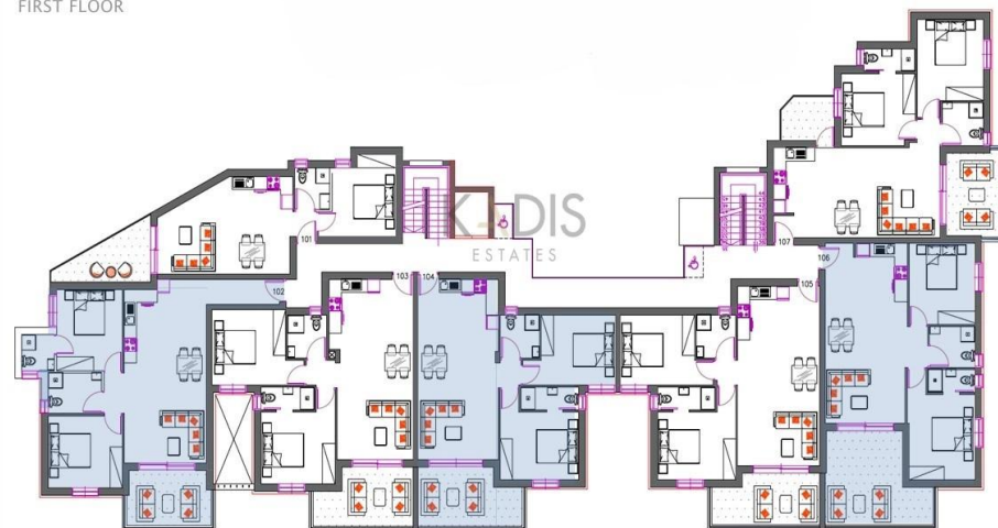
Architectural Plans FIRST FLOOR