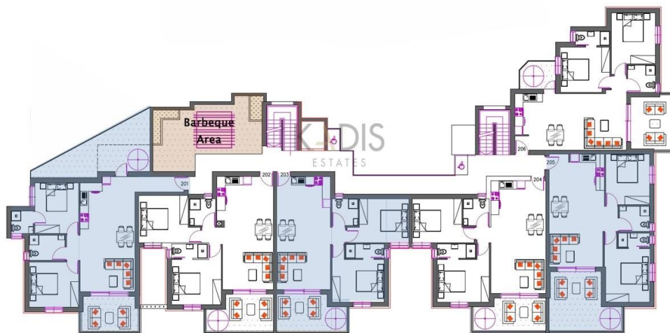
Architectural Plans SECOND FLOOR