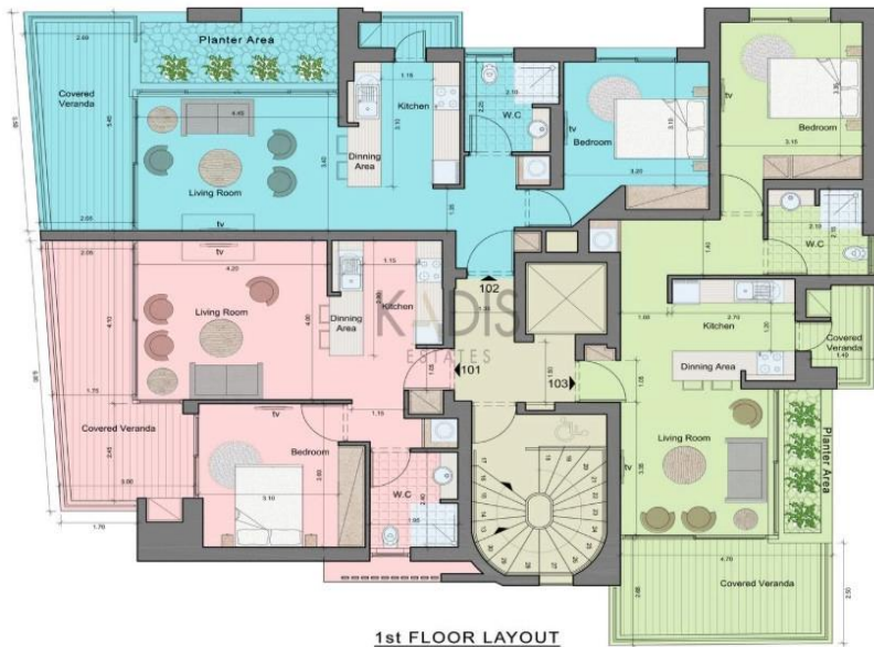
1st FLOOR LAYOUT