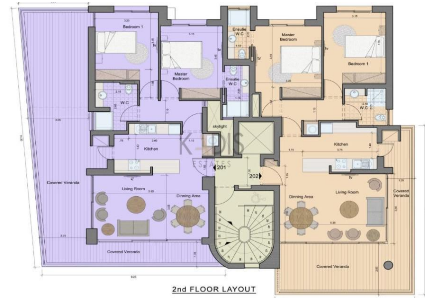
2nd FLOOR LAYOUT