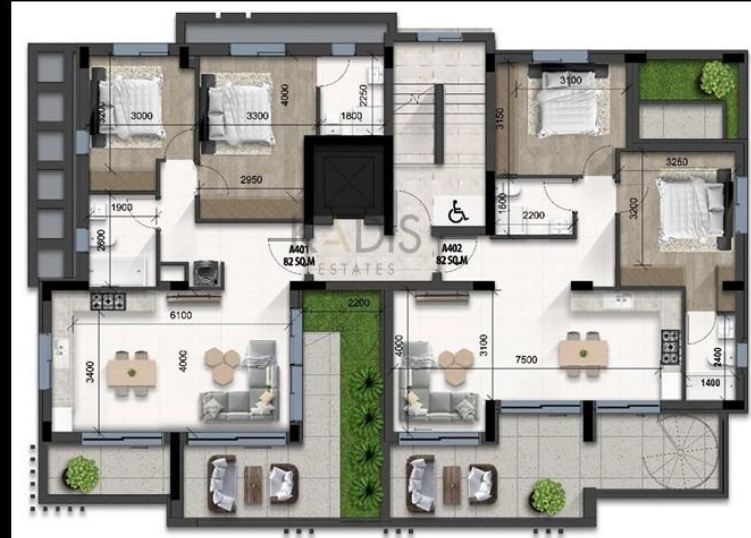
Floor Plan 4th Floor