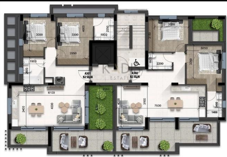
Floor Plan 3rd Floor